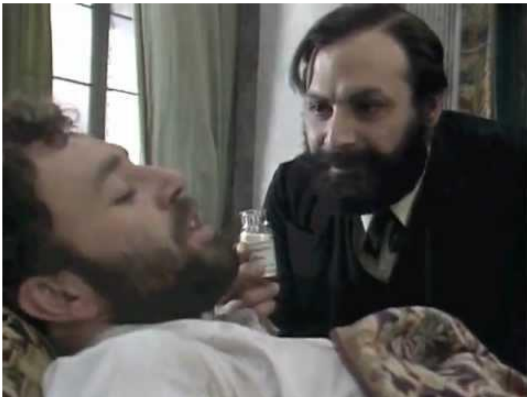
David Suchet as a young Doctor Freud.

Note: many other cast members have not been mentioned as they only appear briefly in a single episode or two.