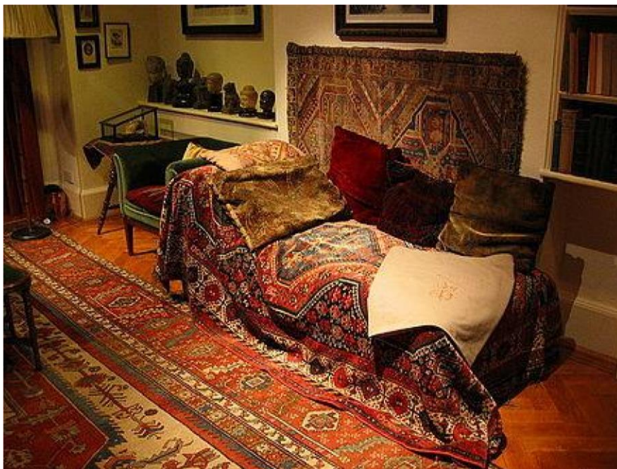
The Freud Museum. The world's most famous couch.