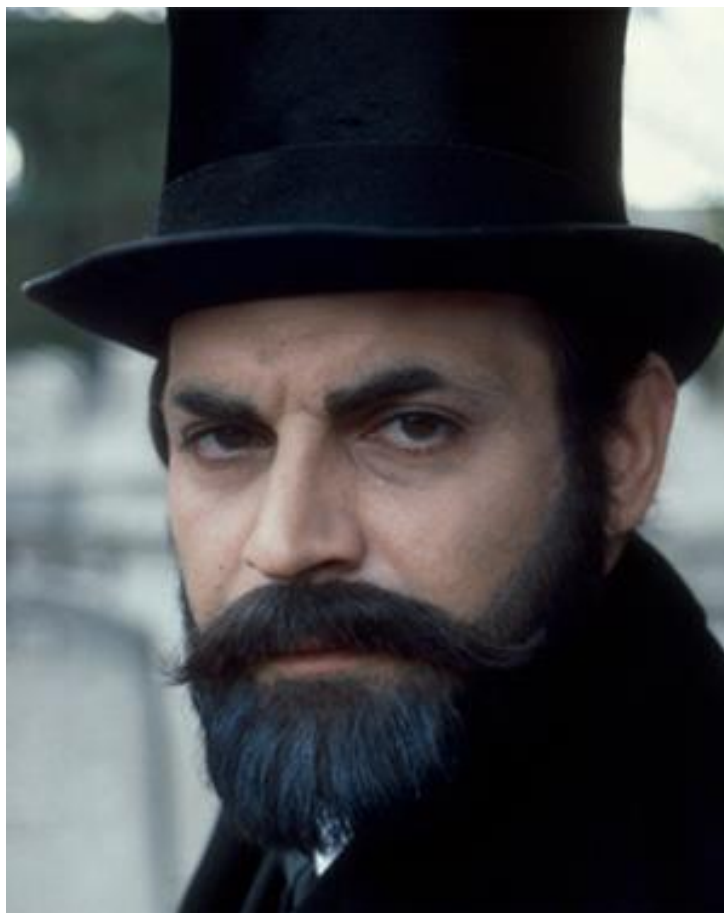
Suchet as Freud in middle age.

The acting is of that type that goes by underrated because it is not showy, mannered or over-emphasised. Instead it makes the characters believable so that the story flows. Even so, when considered in retrospect, Suchet gives a towering performance in the difficult role of Freud. As in so much of his work, his ability to making his acting seem natural, to be the character, goes beyond exaggeration. When he appeared as the aged Freud of 1939 I was initially left wondering who was the brilliant elderly actor they had found to play Freud, then aged eighty-three? I had to check the credits to be sure it was still Suchet in the role.