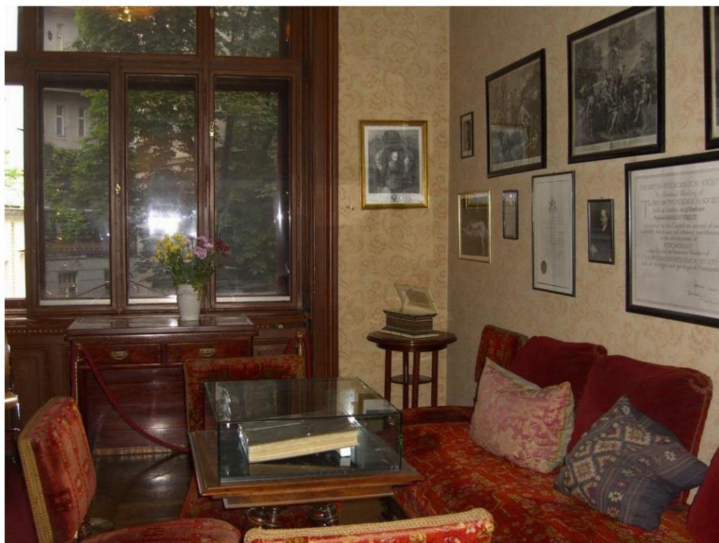
Freud's waiting room. Mar del Sur Wikimedia Creative Commons